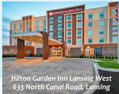
Hilton Garden Inn Lansing West 633 North Canal Road, Lansing

If you plan on attending in-person, make your reservations at the Hilton Garden Inn West by January 3 (call 517-999-9930). Ask for the MMTA Group Rate of $109 (plus applicable fees/taxes).