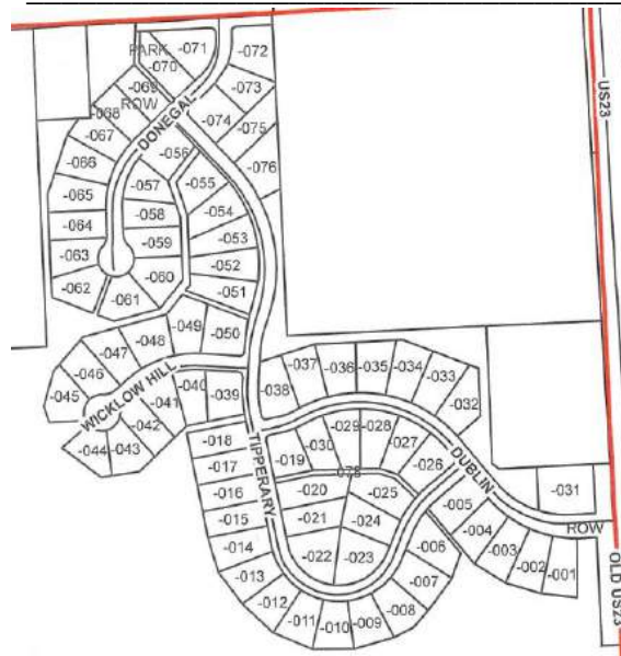
Appendix 2 List of Permanent Lot and Parcel Numbers in the Special Assessment District